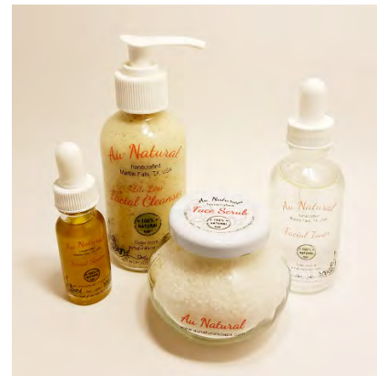
Cleanser, Toner, Serum & Night Cream