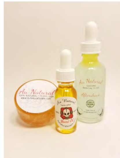
Shaving Soap Bar, Aftershave & Beard Oil